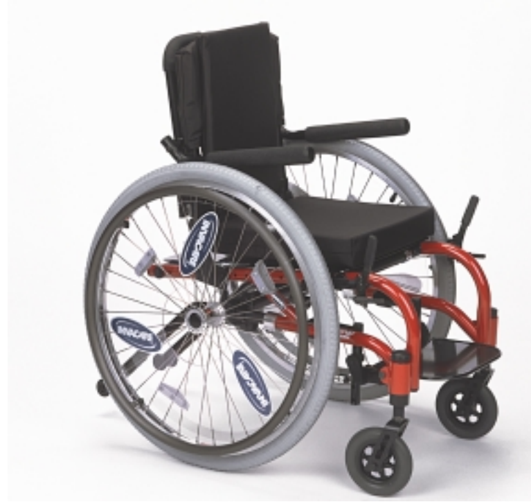
Invacare® Top End® Terminator™ Jr. Shown with optional cantilever arms, spokeguards and adjustable height push handles in their hide-away position.

he Invacare<sup>®</sup> Top End<sup>®</sup> Terminator<sup>™</sup> Jr., is a pediatric chair built to grow. It is designed to maximize mobility while maintaining the most optimum wheel position for propulsion. The adjustable telescopic center-of-gravity, in combination with adjustable seat depth, allows for both growth and seating systems. There are three seat height settings for each wheel size so that the chair can grow from as low as 13" with an 18" wheel to as high as 18" using a 24" rear wheel. The adjustable height front casters will make seat height adjustments easy and quick. The flip-up footboard make tranfers easy and safe. It is the perfect chair for kids on the go!